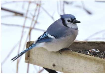
Blue Jay at tray feeder

Finally, water is essential. Most water sources tend to freeze during the cold months and eating snow for hydration is dangerous. It causes a cooling down of their body's core which they need to keep burning hot to survive. By using a birdbath heater or providing a water source with a fountain, aerator, bubbler or flowing water, you can keep it from freezing so it can provide healthy and clean water for the birds during the coldest times.