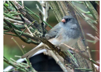
Junco sheltering in shrub

In addition to feeders there are a multitude of plants you can plant that provide fall berries that last into the winter giving many non-seed eating birds such as robins a source of food. Many bird species eat both seeds and berries, so such plants provide wide-reaching support. Examples of good fall winter berries are Crab Apples, Bay Berries, Holly and Winter Berries, among others. You can find lists online or get them from your local nursery.